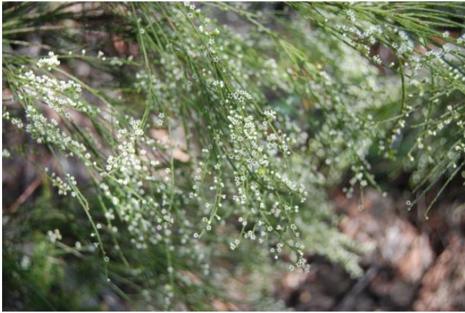
Leptomeria acida , Native Currant

It was a cool, windy day when fern study group members arrived at our location in the Blue Mountains. As luck would have it, it was also quite sunny, so we set off at a brisk pace and were soon quite warm.