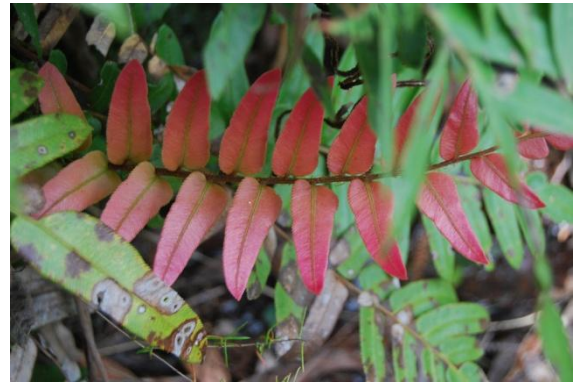
New growth on Blechnum watsii

As we reached the creek towards the bottom of the path, there was a noticeable change in the amount of water around. Whilst the top of the path was quite dry, there were sections towards the creek that were quite muddy, despite no recent rainfall.